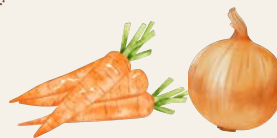
CARROTS & ONIONS, CHIVES

Herbs repel tomato pests and enhance flavor