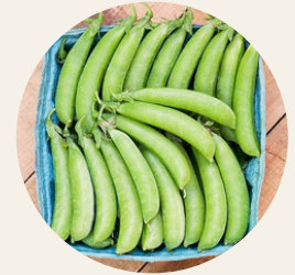
SUGAR SNAP PEAS

Easy Choice: The earliest organic green & yellow beans that are easy to grow and hand-pick. Produce all at once for a heavy harvest of tasty summer beans. A CSA member favorite. Many seeds/4-pack