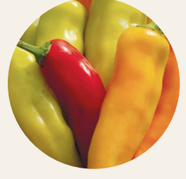
HUNGARIAN HOT WAX

Very spicy hot pepper that is essential for Jamaican jerk chicken recipes. 4" pot