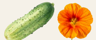
CUCUMBERS & NASTURTIUMS

Onions deter carrot flies and don't hog space