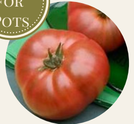
TASMANIAN CHOCOLATE SLICER

Indeterminate. Excellent container tomatoes that produce meaty, juicy, deep purple-red fruit that make the best BLT sandwiches. 4" pot