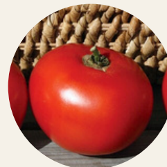
MOUNTAIN FRESH PLUS

Indeterminate. Large fresh market beefsteak tomatoes average 10-12 oz, full flavor. 4" pot