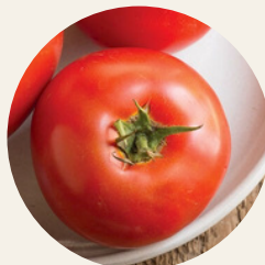
BIG BEEF PLUS

Indeterminate. Red slicer. Grows well hot and cool summers in our region, resistant to wilt. Round medium-sized fruit. 4" Pot